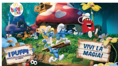
Italy: McDonald's 'Happy' and The Smurfs (Altroconsumo)