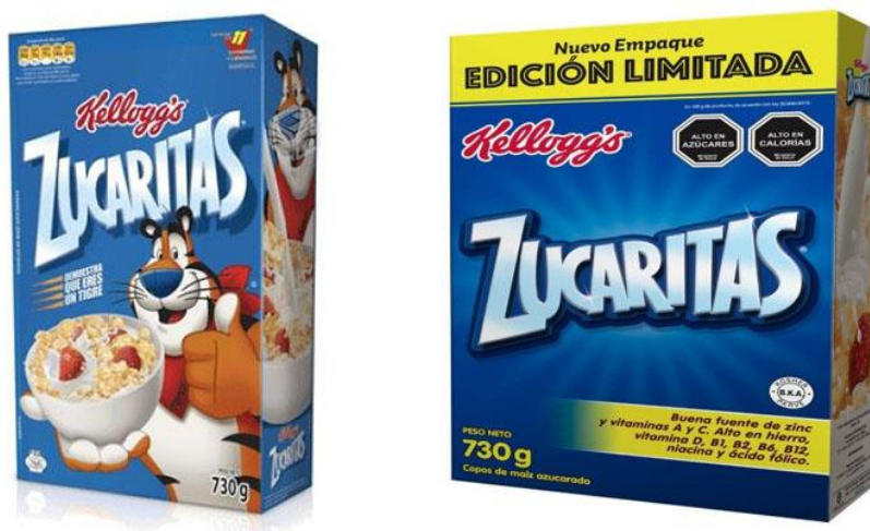
Figure 2 Before and After Implementation of the Law.

The Chilean government took a strong stance and announced fines for non-compliance in November 2016 20 . It was a swift response to the three food companies (Nestlé, Kellogg's and Masterfoods, the distributor of Mars' M+Ms in the country) who refused to remove their brand mascots on products which failed to meet the requisite nutritional criteria.