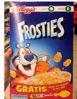
Example 3 Kellogg's Frosties' 'Tony the Tiger'