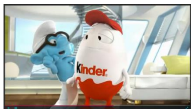
Switzerland: Kinder and The Smurfs (FRC)