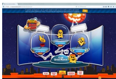
France: Monster Munch (UFC Que Choisir)

Research has shown that characters can influence diet-related behaviours of children, especially with regard to energy-dense and nutrient-poor foods 17 . Their use should be restricted to healthy produce to encourage young children to increase their consumption of fruit and vegetables for example.